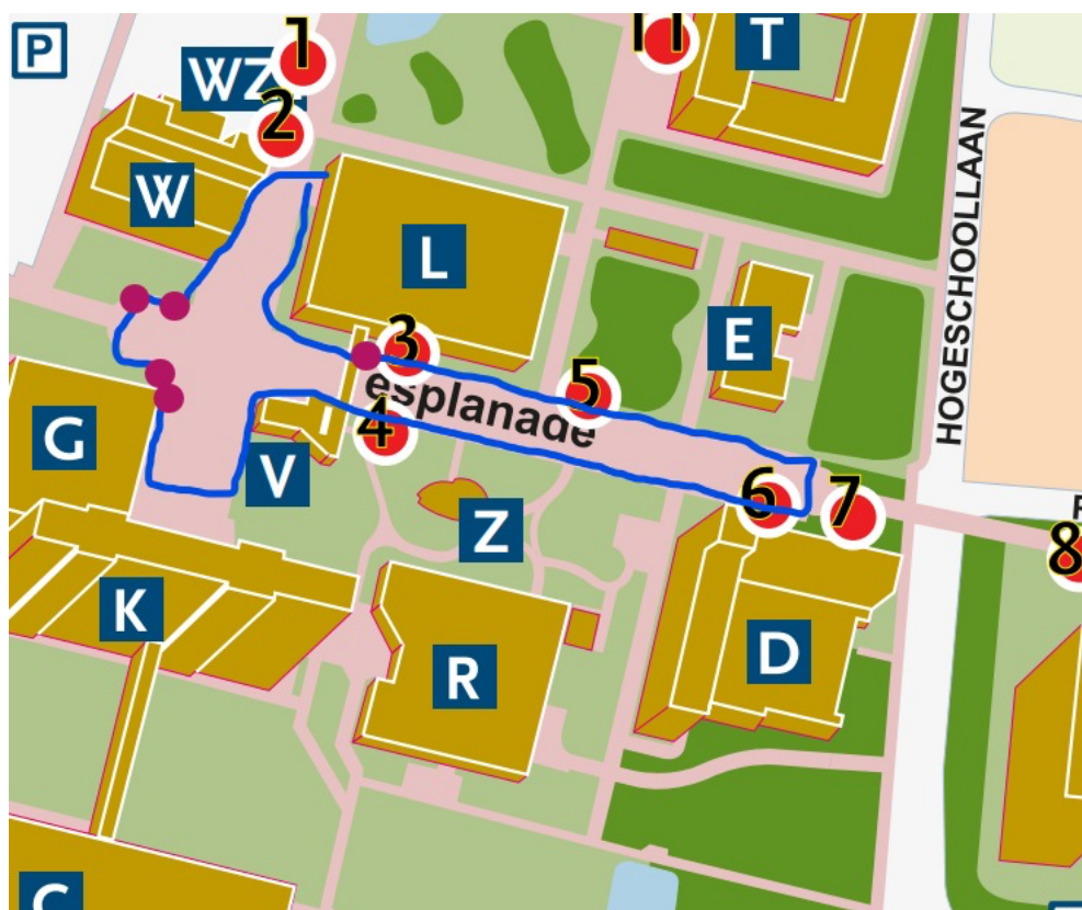
Figure 2: SAM stunts