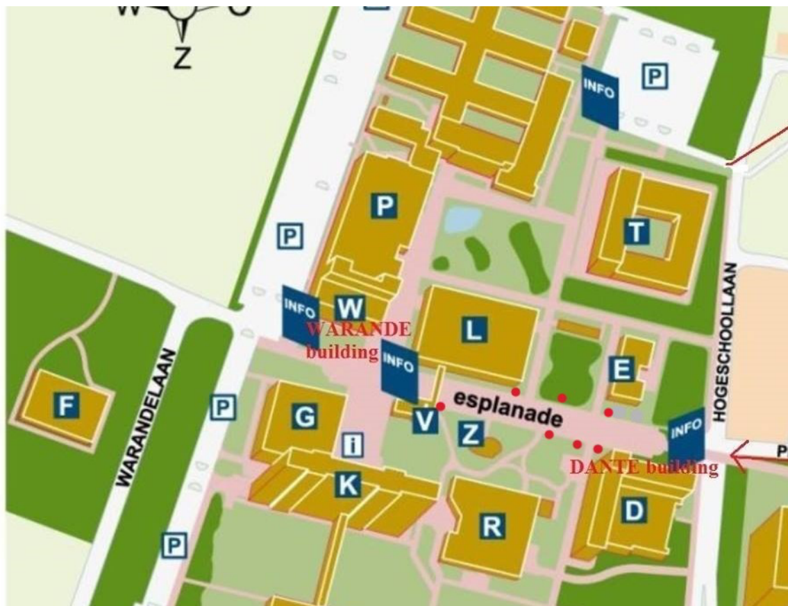
Figure 1: Front stunts